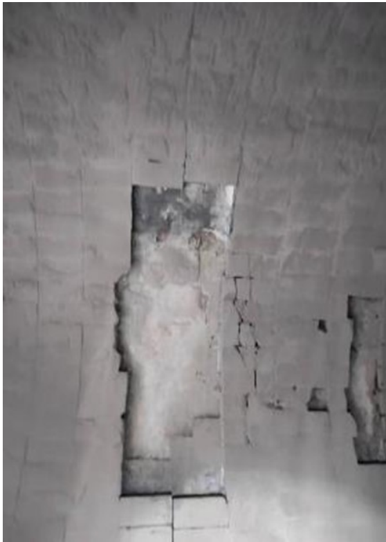
Figure 5 (below) — Inspection of Superwool 1650SI Board lining in torpedo at 1 year service life