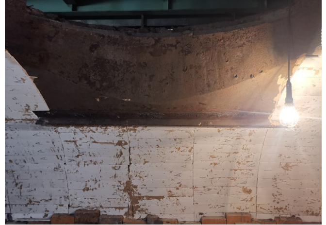
Figures 2 and 3 - Installed Superwool 1650SI Boards in torpedo ladle